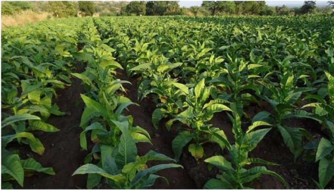
Il kentucky, materia prima del sigaro toscano, è il tabacco coltivato in Valtiberina

Avrà validità fino al 2025. Una boccata di ossigeno per i coltivatori della Valtiberina, terra di eccellenza per la produzione del kentucky